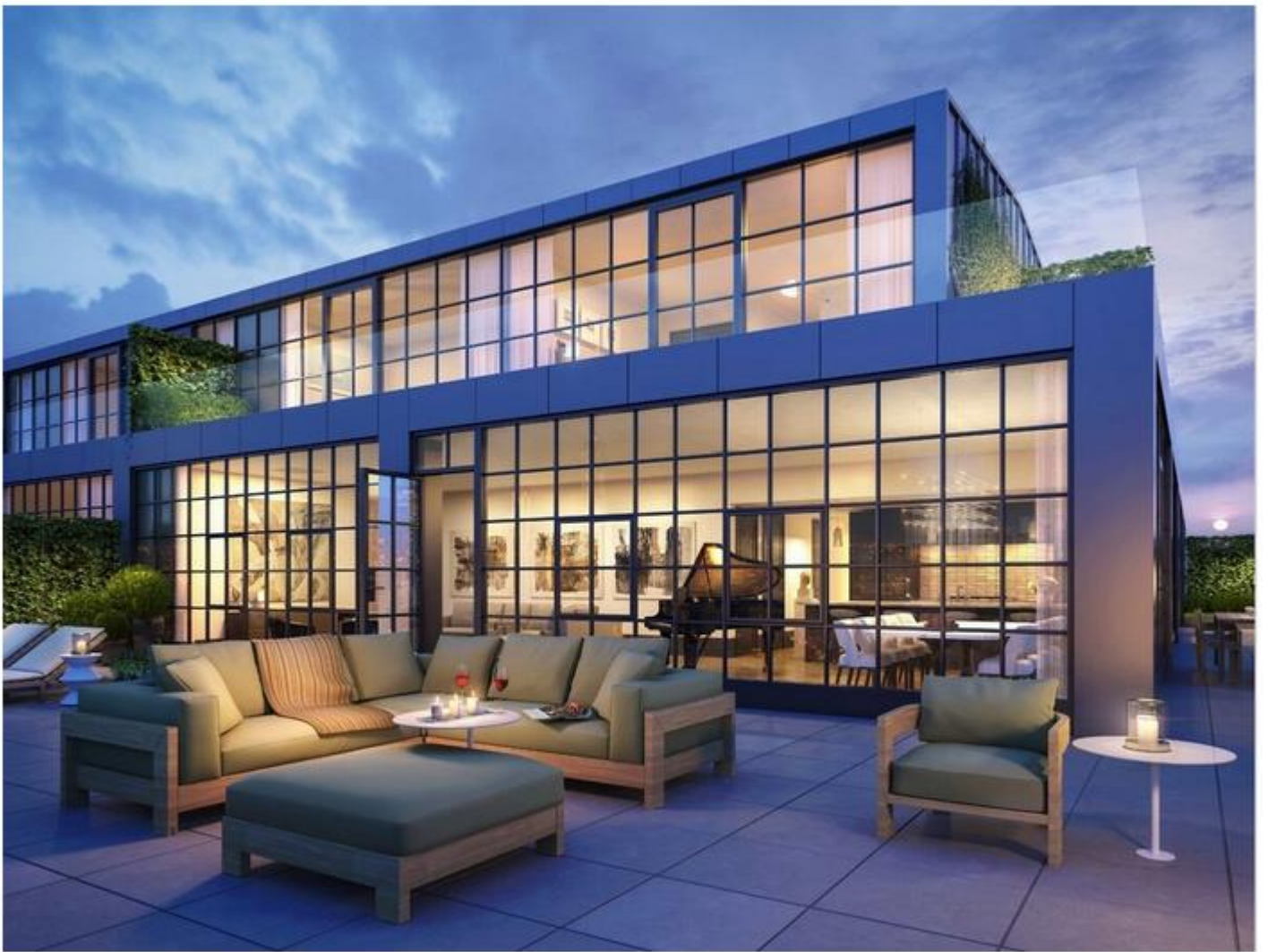
The penthouses at 51 Jay St. will have private terraces. Rendering courtesy of Heavenly