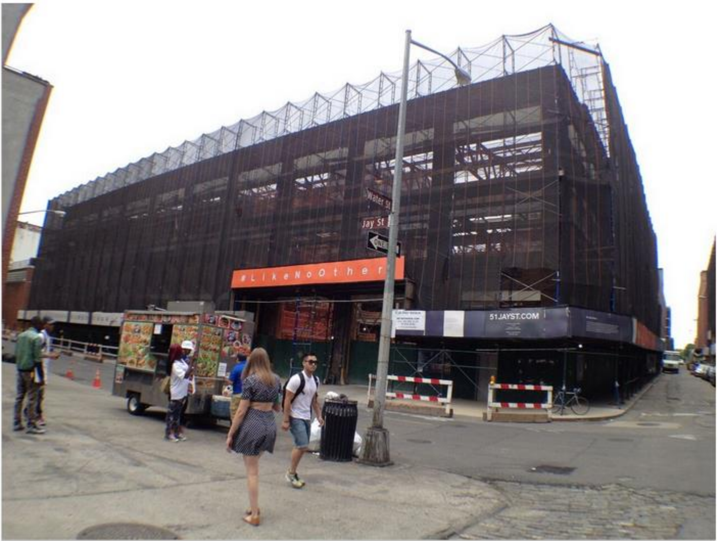
Real-life 51 Jay St. is shrouded in construction netting at this point.