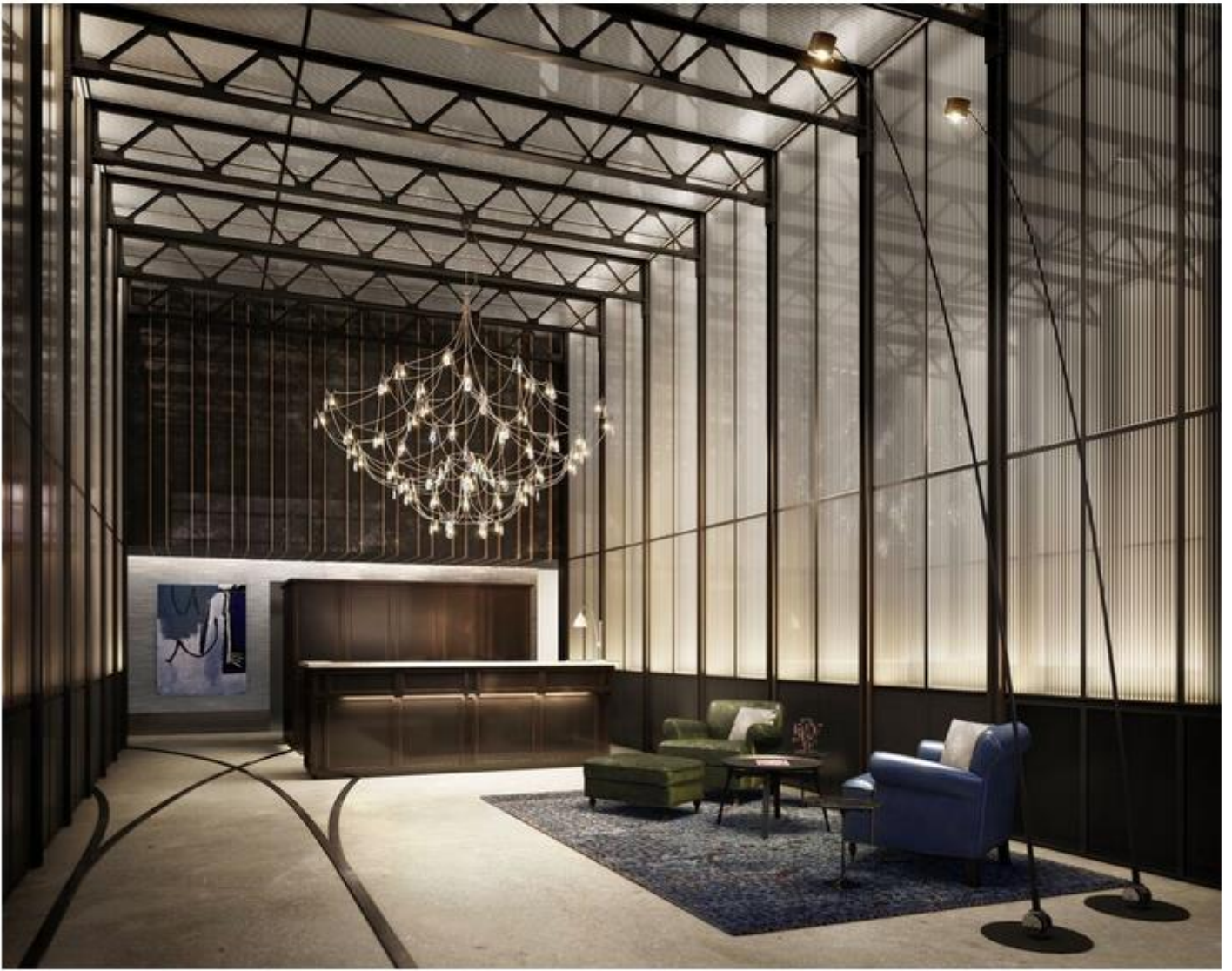
The lobby will have a sky-high ceiling.