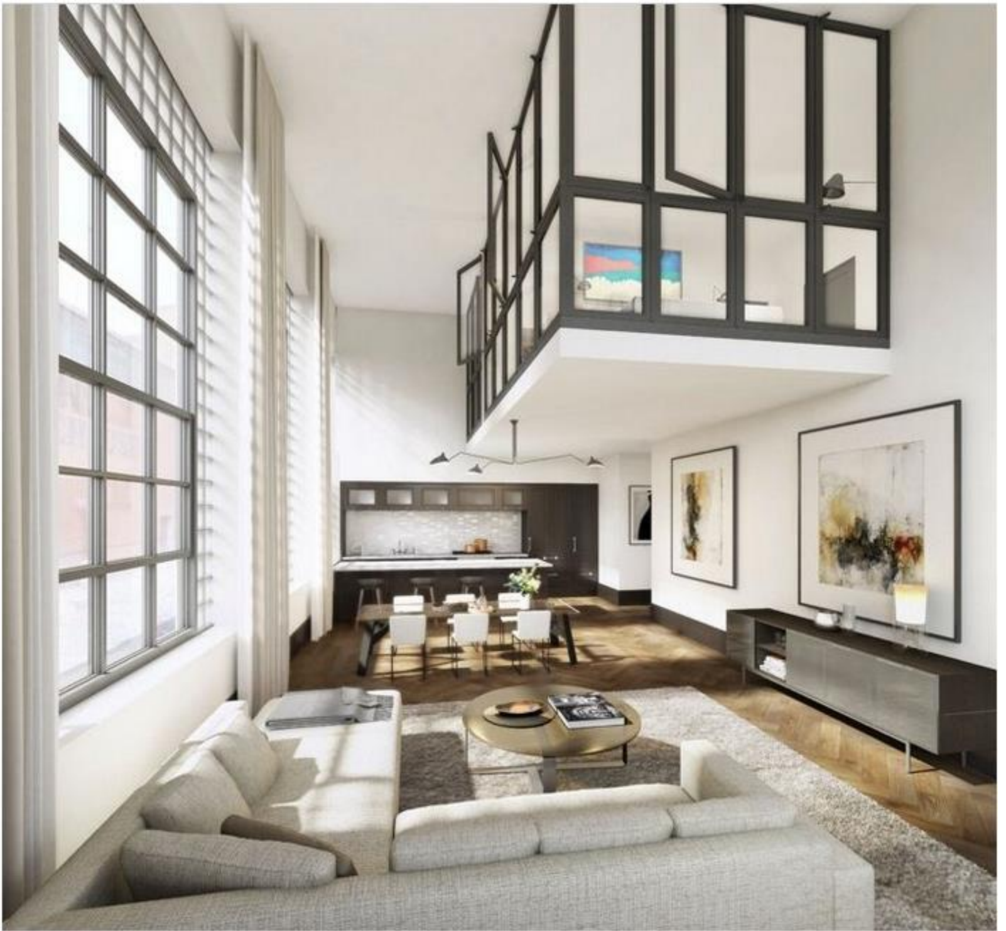
A fine duplex design.