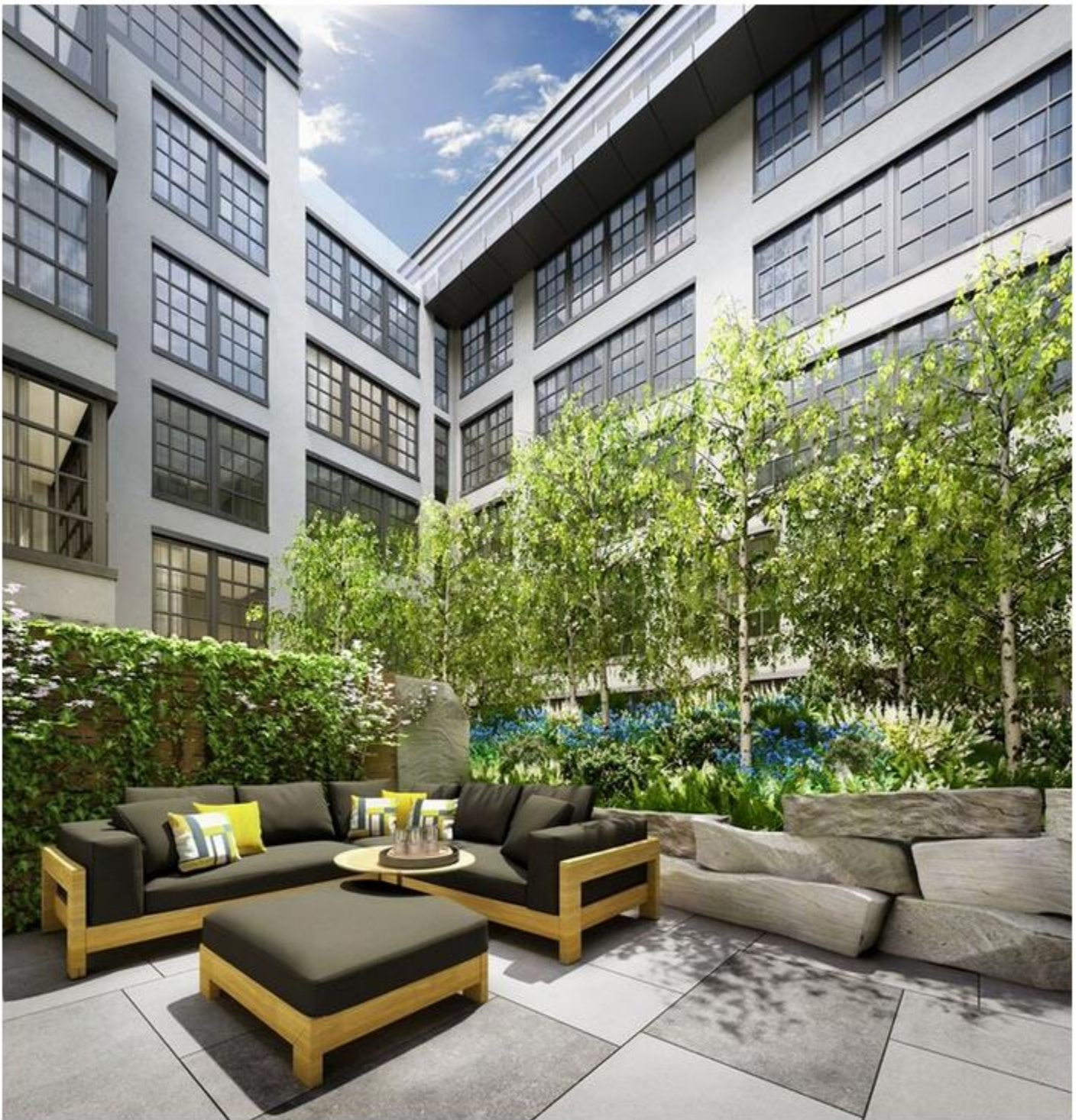
A leafy courtyard for leisure moments.